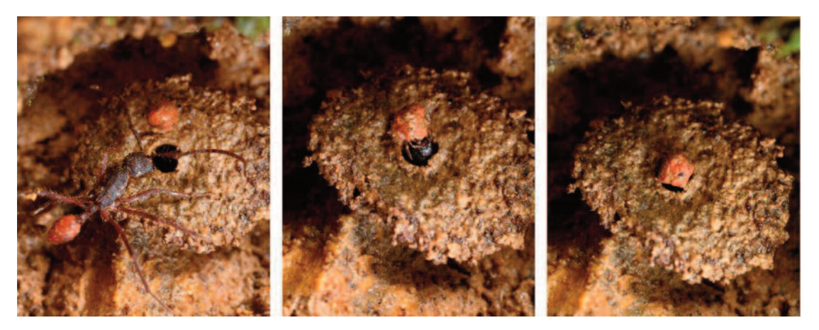
A very simple instance of a similarity to humans is shown by door-maker ants, Stenamma alas, which find a pebble of a suitable size to serve as the door to the colony entrance. In the left image an army ant has located the unprotected entrance; as soon as this enemy backs away, the guard ant within sticks her head out of the entrance to grab the pebble and move it into place (middle image). The image on the right shows the pebble blocking the doorway.

Those similarities are seldom as great or exclusive as they might seem. Insomuch as chimps and bonobos think as we do, the parallels often extend to other animals, too. Both are like us in recognizing themselves in a mirror; then again so do dolphins, elephants, and magpies. A claim exists, widely doubted, that ants do, too. At one time chimps were thought to be unique among nonhumans in making tools—employing twigs to snare termites is one example. Yet we know now of other toolmakers, such as woodpecker finches which